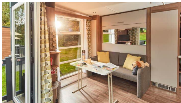
The main double bed is a “Pull Down” with the handle for this at 2meters high. The bed requires a reasonable amount of effort to pull out.