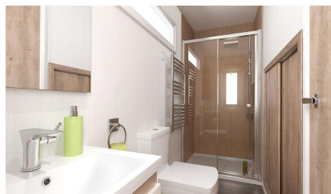
The bathroom inside the Glamping pods is very narrow.