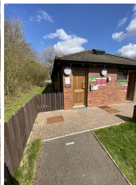
Access to the lower toilet block is via a dropped kerb or a tarmac path