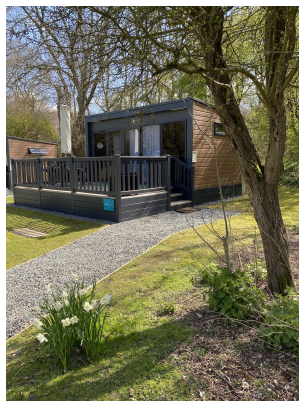
Stepped access up to Glamping Pod only.