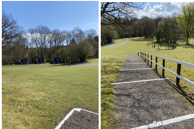
The approach to the Glamping Pods is via a two way tarmac road for both pedestrians and vehicles or via steps from the main site road onto a grass area opposite the pods.