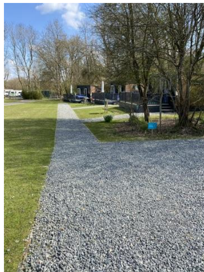
The path to the glamping pods is gravel