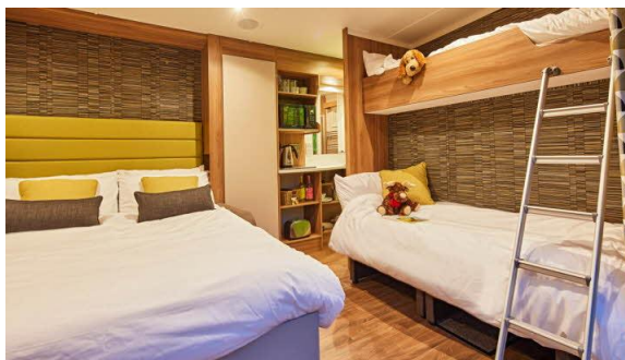
With all of the beds pulled out there is limited moving space.