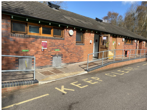
Access to the top toilet block is via a dropped kerb