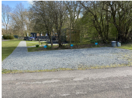
There is a parking space for each glamping pod on gravel