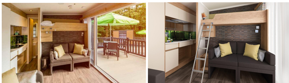
The corridor to the kitchen and bathroom is very narrow as can be seen in the left of the photos.