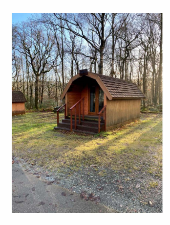
There is stepped access into the camping pods only