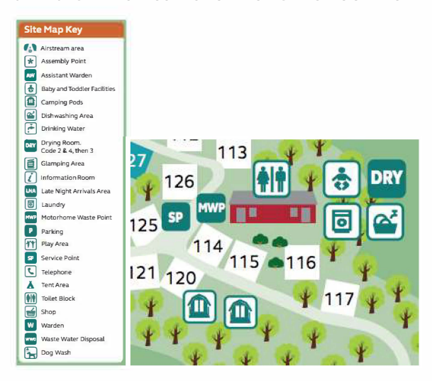
The camping pods are within 50m of Toilet Block C

There is moveable furniture which can allow for extra room for movement.