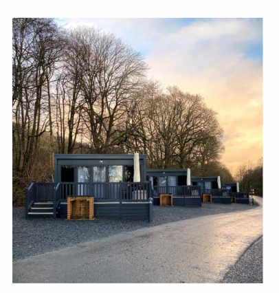
Stepped access up to Glamping Pod only.